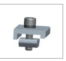
D : Rail clamp